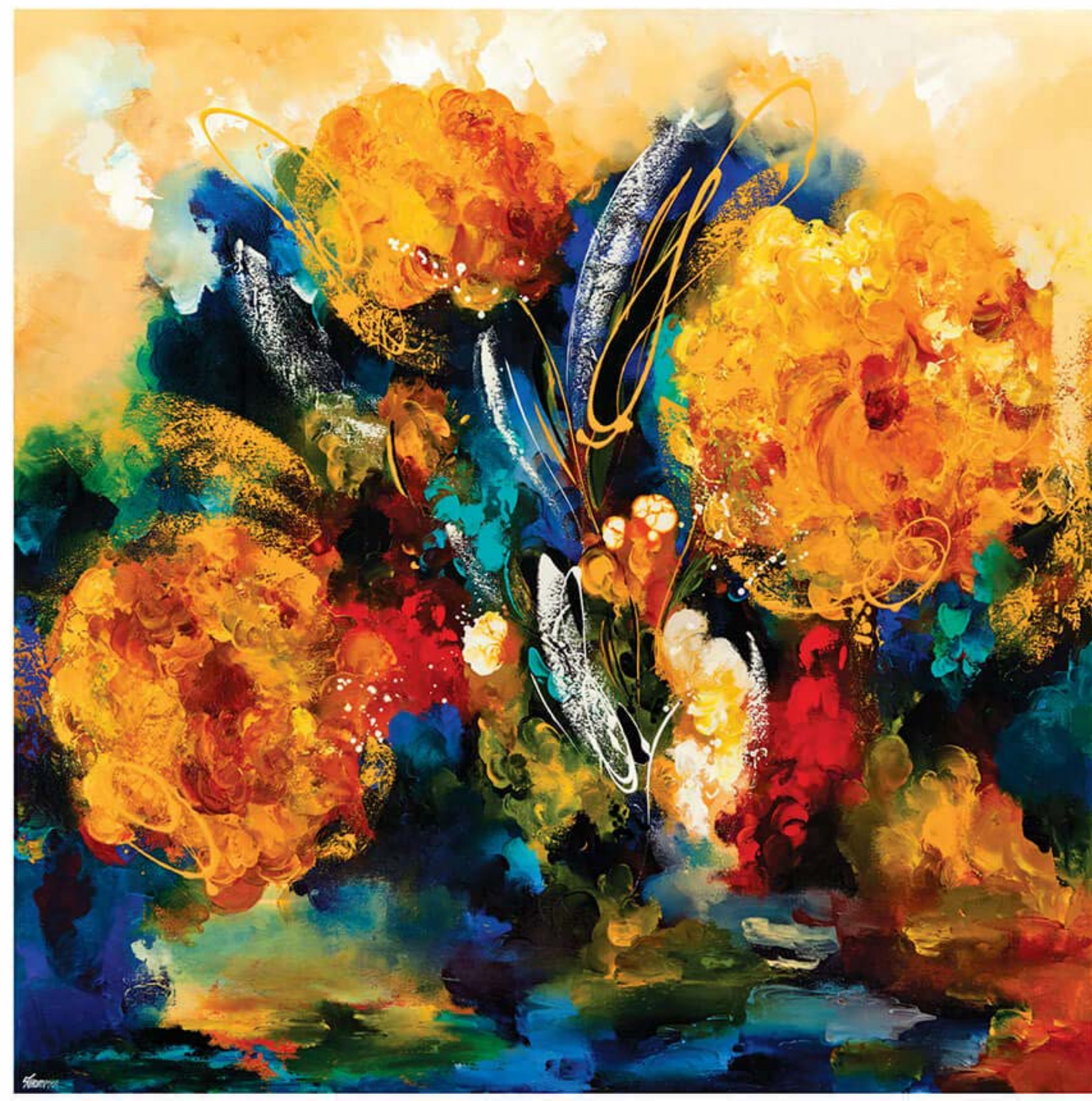
Sabia's Turquoise 48° x48°

different direction, I let myself follow that direction. When I don't stick rigidly to an idea, I find that I come up with much more exciting pieces. Those pieces that surprise me are also usually the most engaging for viewers, precisely because they are unpredictable," she points out.