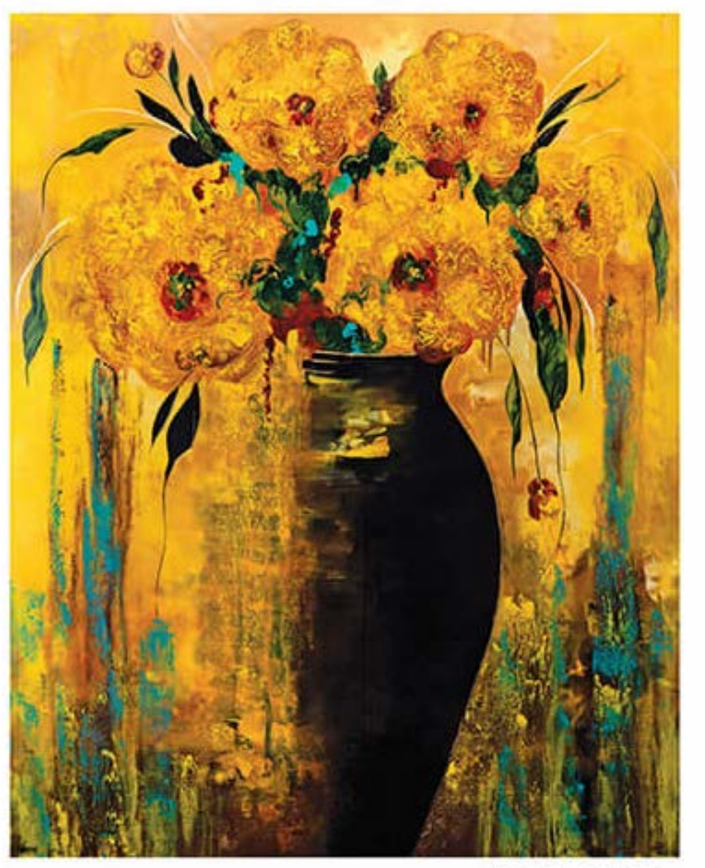
Barcelona Eve, 48" x 48" Mandarine, 60" x 48"