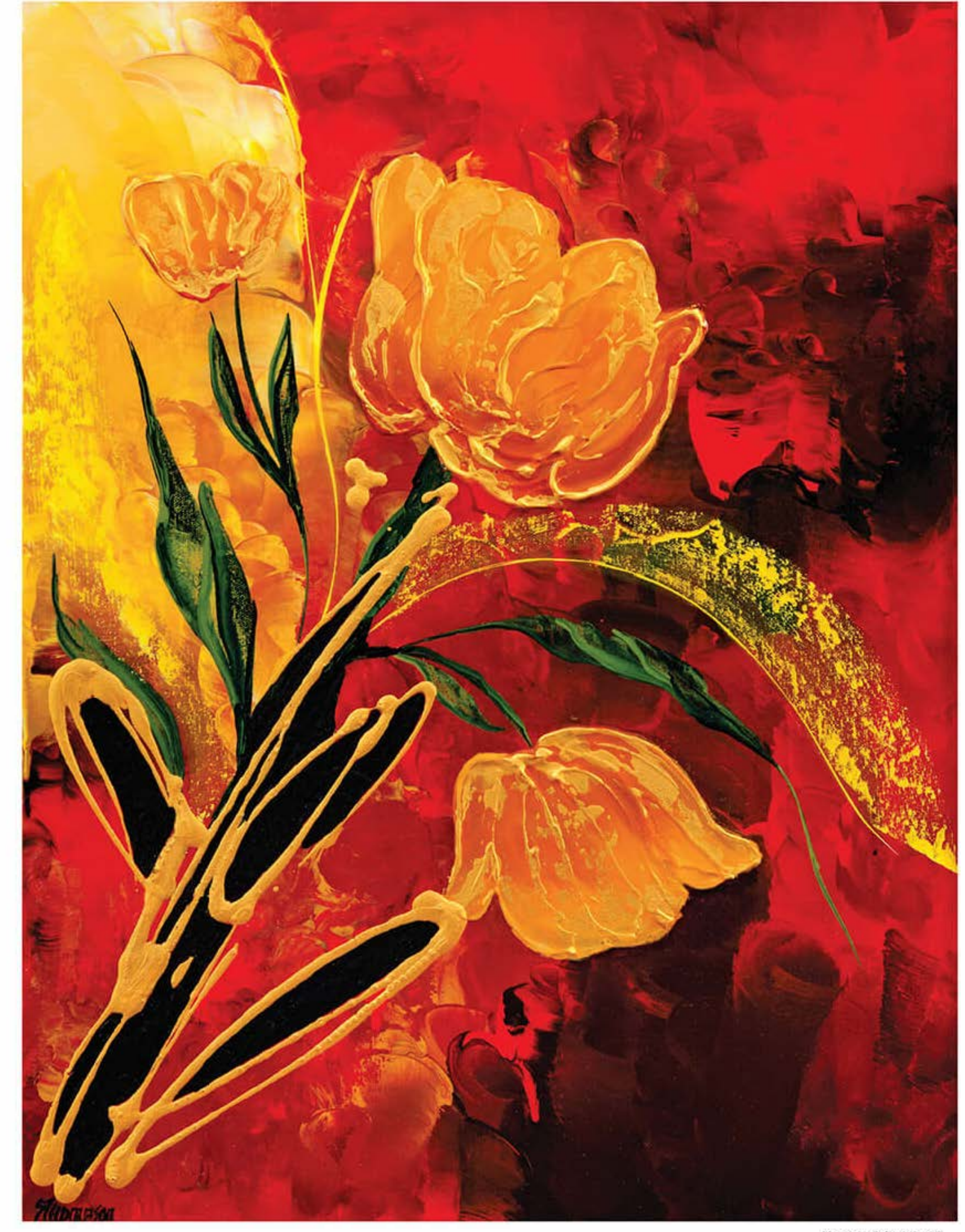
Moroccan Ruby, 24" x 18"