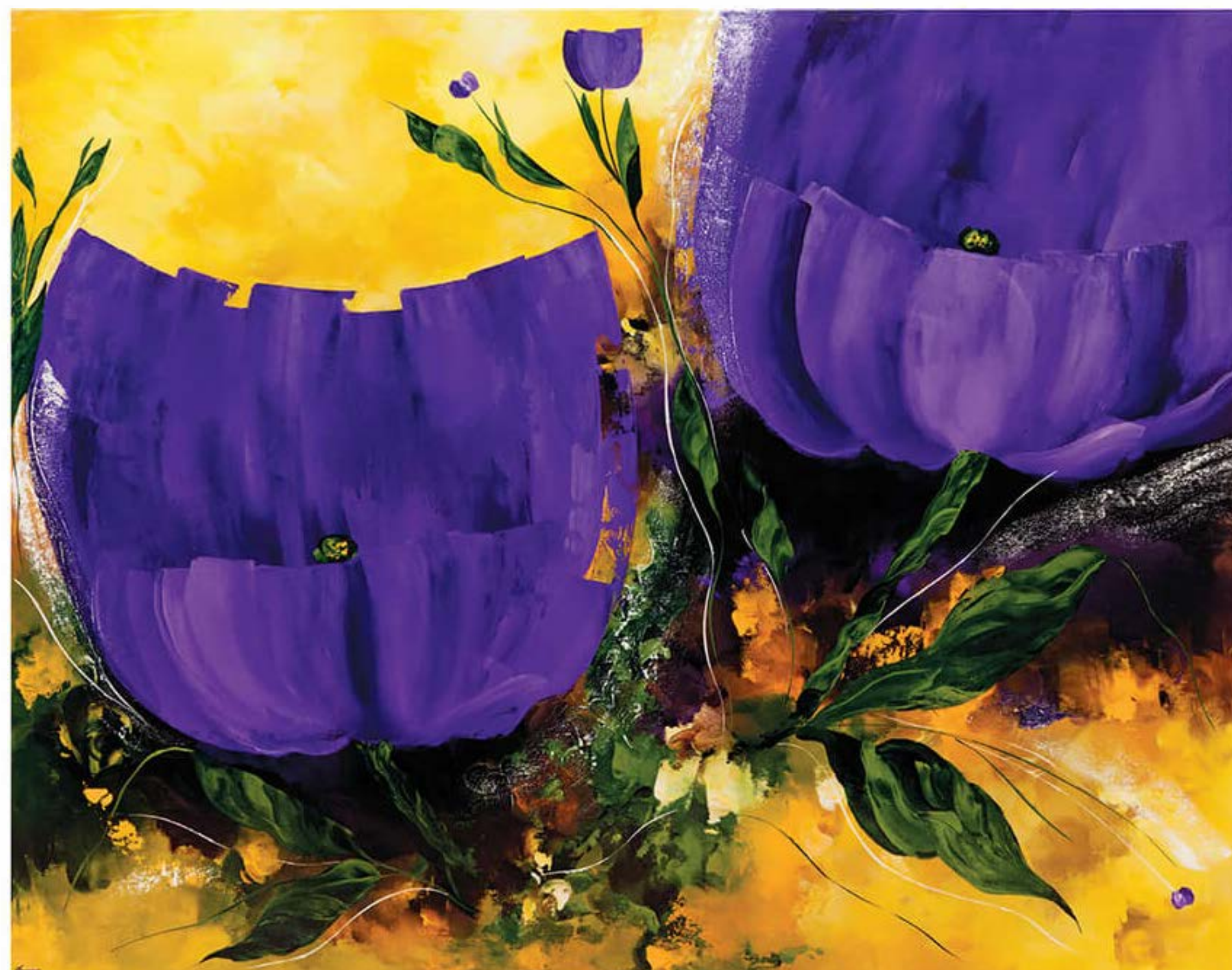
prévious page, Lu mona Déltà, 48° x72° left, Birch and lifs, 48° x36°