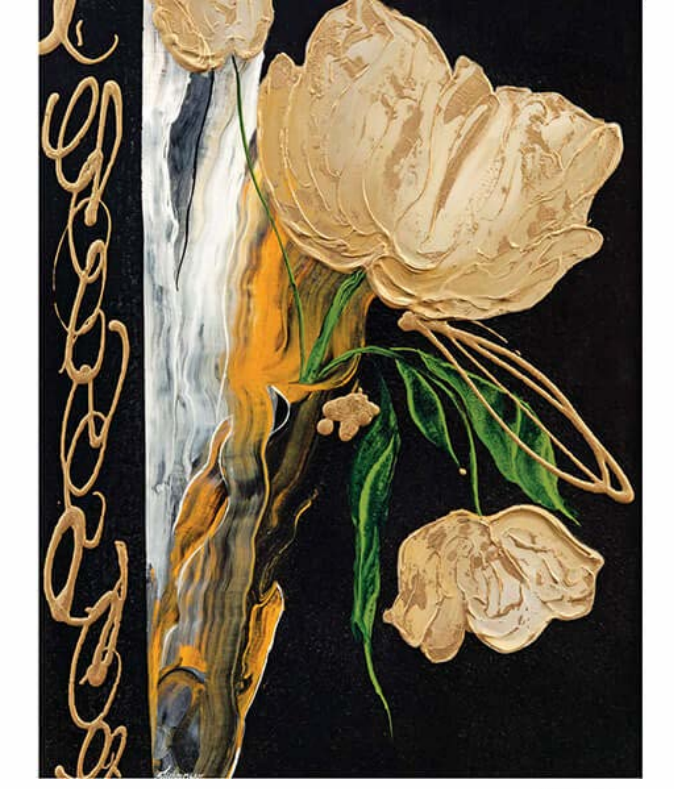
Flores, 24"x 18"